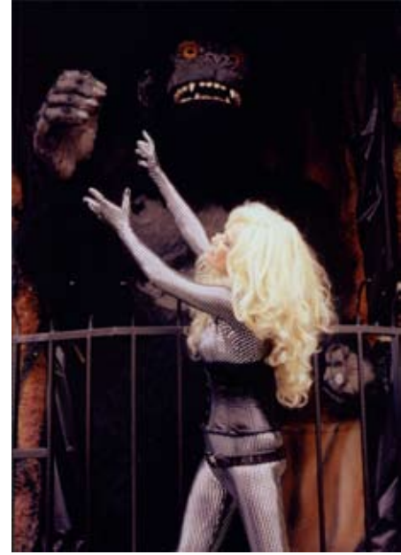
Ulrike Ottinger, Prater , 2007, 107 min., digital still

The RISK season closed with a screening of student films. Created by students in the film and media studies program at the University of Florida, the films showcased the innovative work of the next generation of filmmakers.